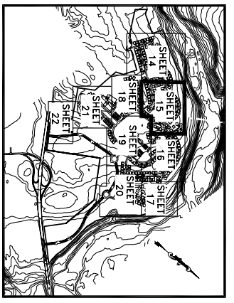
KEY MAP NOT TO SCALE